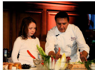
Raymond Blanc OBE preparing Crêpes Suzette with a Junior Sous chef he plucked from the audience