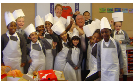
Albert Roux OBE with a class from Herbert Morrison School, after a taste session in October

The students at Herbert Morrison School in Stockwell experienced a Chefs Adopt a School session to end all sessions. After all, it's not every day you have Mr. Albert Roux OBE explaining how stimulating a French Baguette can be to the senses. Albert was on hand to deliver the taste and senses session to the class, as well as the blindfolded vegetable identification game. As always, the session was excellently received and the class proved very able and enthusiastic when blindfolded and identifying the fruit and veg. Albert explained the origin of all the fruits and vegetables, demonstrating just how cross-curricular CAAS can be.